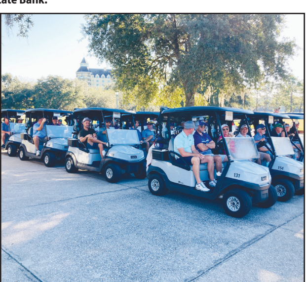
The golfers begin the day.